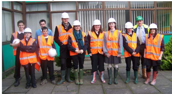
Members of the Executive Council visit the new school site

The S6 Heads of School also attend Council meetings and act as Chairperson for S1 and S2.