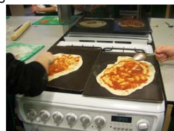
Learn basic Italian and how to make the best pizza under the sun