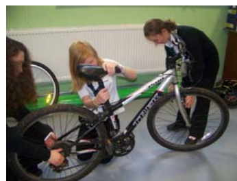
Basic Bike Maintenance