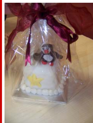
Decorated Christmas Cake in presentation wrap

These took place in November and were well received. They focused on skill development and working with others. We were lucky to offer a variety of options and hope to do something similar before the summer holidays when hopefully the weather will allow us to offer more outdoor challenges. Activities ranged from curling to cake decorating and photography to planter making.